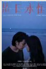
Eternal Sunday (2020) LV Shiyu