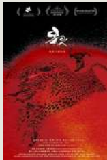
Olympic (2022) ZHU Xin