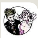
half past selber schuld

Born in Hyogo, Japan. After working as a fine art teacher at junior high school for 6 years, she returned to university to study Conceptual Art and Animation based on Japanese Paintings. M.A. in Fine Art. Since 1997, she has been making abstract animations synchronized with language, sounds, and music about the theme - we can understand each other without necessarily understanding each other's language. Her films often use images from her daily life made while visiting or living in foreign countries. Introspection (1998) was made in the United Kingdom, Üks Üks (2003) in Estonia, and Wiener Wuast (2006) was made in Austria. Wiener Wuast was shot in Vienna with real view, with a drawing in her hand. She has done workshops in the same way in Taiwan, Norway, Croatia, Israel, Kyoto Poland, Italy, and more. She has been a lecturer at Kyoto Seika University from 2000 to 2021.