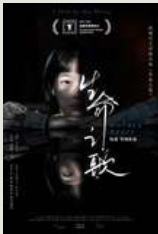
Double Helix (2021) QIU Sheng